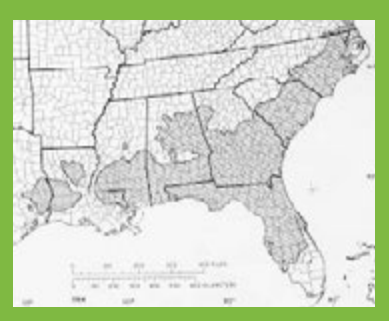
native range of longleaf pine.

Much of the remaining acreage exists as fragmented stands in varying degrees of isolation. Recently, however, many organizations and agencies have taken steps to prevent further loss, improve what's left, and restore the longleaf pine ecosystem where possible. Florida's Longleaf Pine Ecoystem Geodatabase contributes to this effort by providing detailed, baseline data on the location and current ecological condition of remaining longleaf sites in Florida.