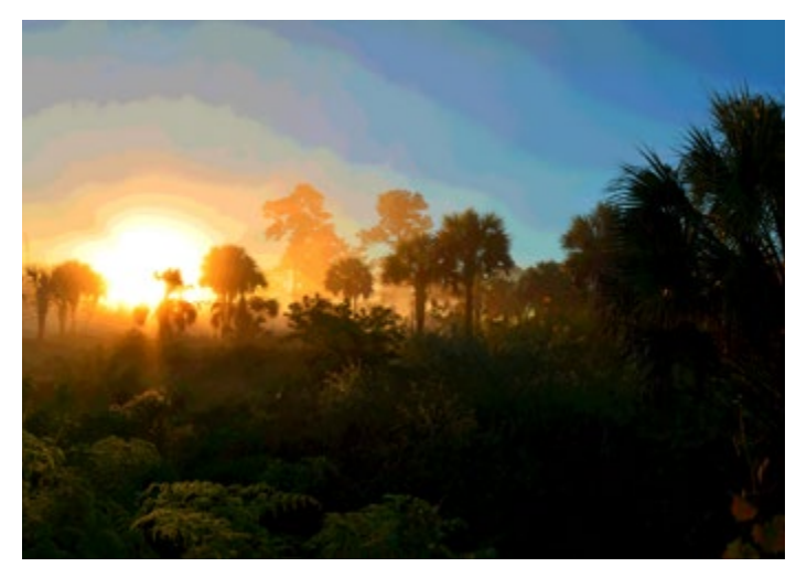
Creative Category: "Poster Sunrise" by Susan Stocker Picayune Strand State Forest.